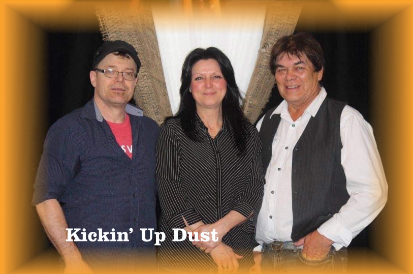
Kickin' Up Dust