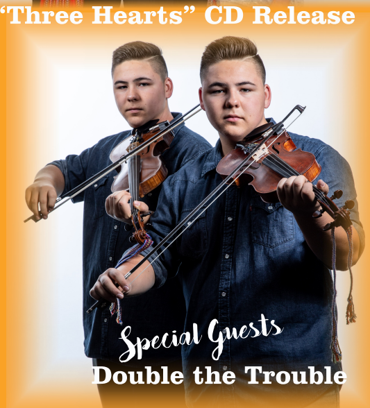
Special Guests Double the Trouble